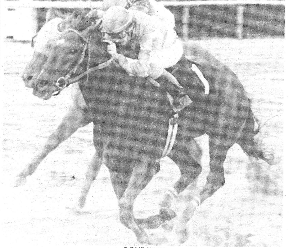
GONE WEST ... Defeats Shawklit Won in Gotham